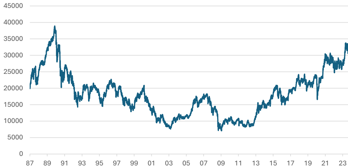
Chart 4: Japan's Nikkei 225 Close to the Top of the Mountain