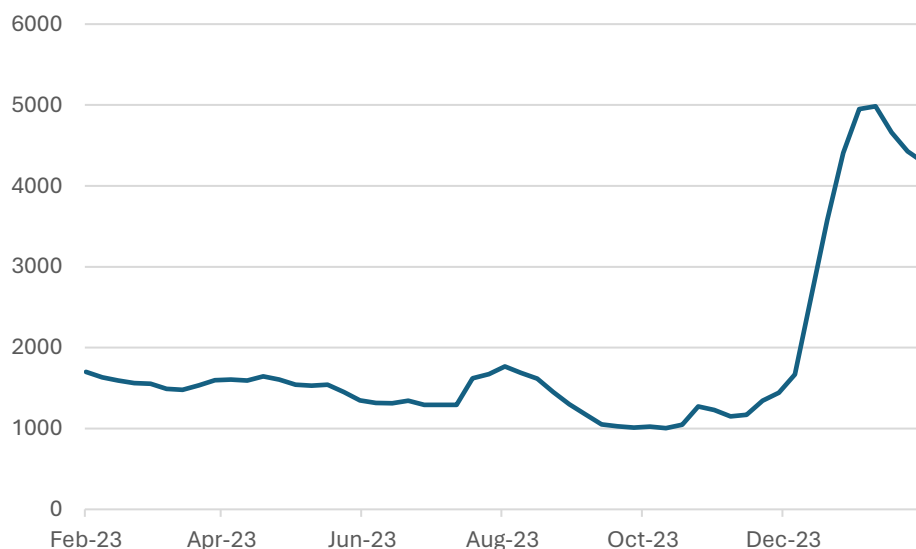
Chart 5: Rotterdam to Beijing Freight Rates per 40m Box