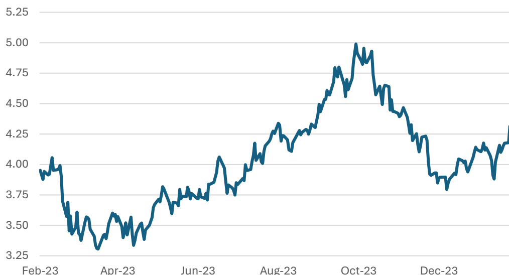
Chart 3: US 10-year Government Bond Yield Trending Higher since December

The trend in the US 10-year bond yield is instructive. From its December 27 low, with some volatility, the yield has been trending higher. The stickiness of inflation is quite apparent to the market. Also, the much-reduced market expectation of a March rate cut has taken its toll on the yield curve. We believe that a yield of 4.0% is around fair value for the US 10 year.