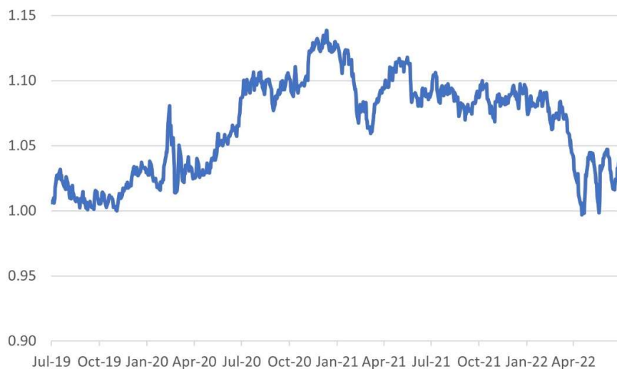
Chart 4: USD/CHF