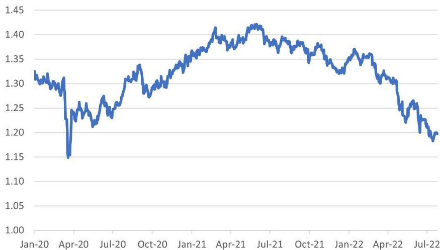
Chart 3: USD/GBP

Ironically, sterling firmed up above the $1.20 level last week. It might be that after the bad economic news, investors were thinking about how much worse could it get? We sense that sterling still has more downside, although we also believe that the currency is in value territory.