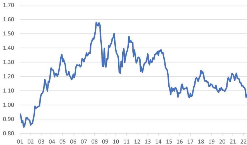
Chart 1: EUR/USD

The gas has to move through a pipeline – and not shipped – and there simply isn't the infrastructure to redirect the gas to another part of the world. Russia would lose out on significant revenues.